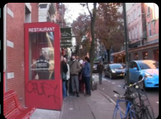
About the Wait