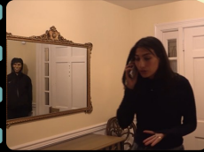
The Prank Call