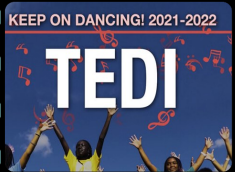
TEDI: Keep On Dancing