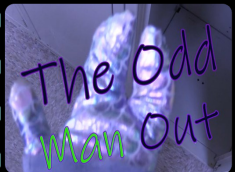
The Odd Man Out