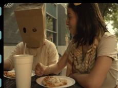
Bagged a Good One